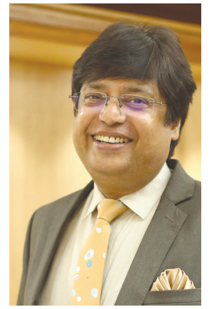
our prudent investments in technology and innovation that are reaping us high returns."