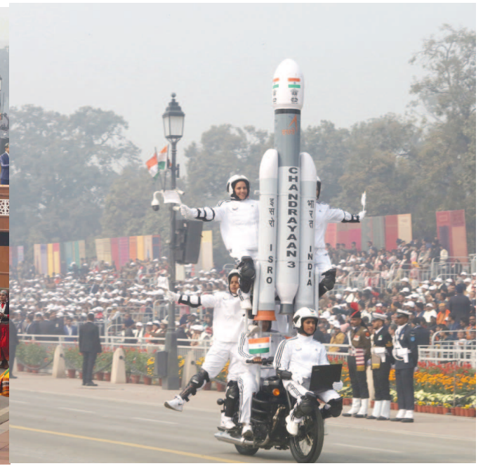
Glimpses of 75th Republic Day Parade at Kartavya Path, in New Delhi on January 26, 2024.