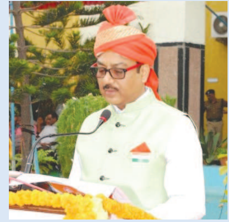
moment of pride for the Zone, as Prime Minister Narendra Modi flagged-off four Vande Bharat Express Trains, 13 MMTS Train Services and two Passenger Train Services on different occasions, he said.