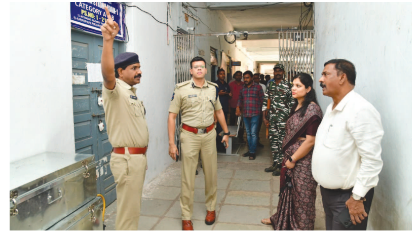
District Collector, CP who inspected the security at the strong rooms.

Karimnagar (Siricilla) May 15 (TIM Bureau) : Karimnagar District Collector Pamela Satpathy and Police Commissioner Abhishek Mahanty inspected the police security at the strong rooms of EVMs of seven assembly constituencies kept in Karimnagar SRR College on Wednesday. All separately secured strong rooms were monitored and security reviewed. The District Collector and CP discussed the performance of CC cameras, the performance of duties of police personnel and any additional security issues to be