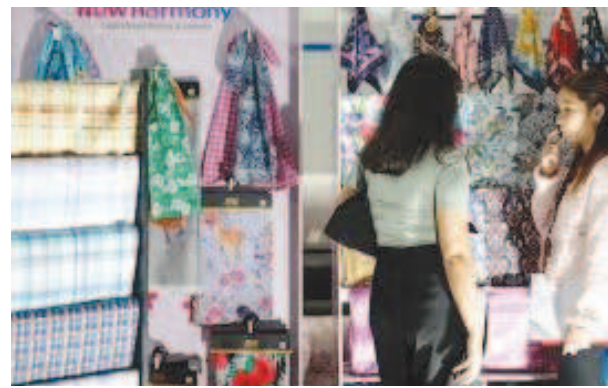
Garments Association in Myanmar and Hong Kong Myanmar Manufacturers' Association Limited also participated in this fair, the MGMA said.

China displayed their products in the expo, it said. In addition, the event highlighted made-in-Myanmar products, including clothing, accessories, shoes and domestic bags from small and medium-sized enterprises, with the aim of promoting and introducing these locally produced goods, it added. The Korea