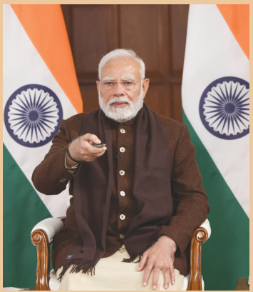
Hyderabad, Jan 6 (IANS) : Prime Minister Narendra

Modi on Monday virtually inaugurated the Charlapalli Railway Terminal in Hyderabad and said this would accelerate regional development. It is the fourth terminal station in Telangana after Secunderabad, Hyderabad and Kacheguda.