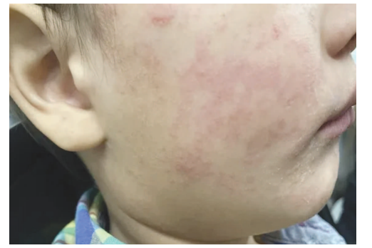
Health Services. The outbreak has turned deadly.

Texas is experiencing the most severe outbreak as 400 cases have been identified since late January, and 41 of the patients have been hospitalised, according to the Texas Department of State